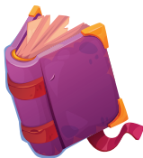
Into the Wild