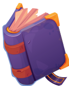
The Hidden Life of Trees