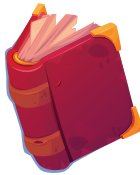
DK Eyewitness Travel: Ancient Rome