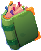
The Little Dictionary of Fashion