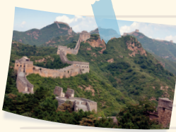
The Great Wall of China

A super long wall in China that was built a really long time ago to protect against enemies. I spent five hours to see it. It's the most amazing place I have ever seen.