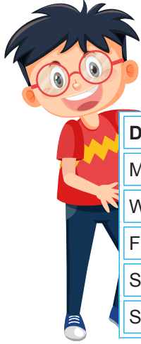
David's Weekly Activities

7. Look at the table and complete the text with the correct information.