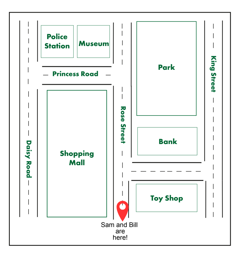
Sam: Sorry, how can I get to the -----?

5. Look at the map and complete the conversation with the name of the correct place.